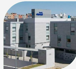
Viamed Santa Ángela de la Cruz Hospital