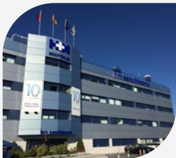
Madrid Norte Sanchinarro Hospital